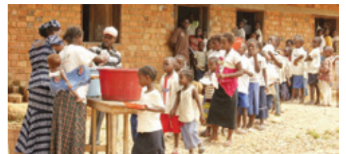
To Expand the program of feeding all the school kids from primary to secondary school