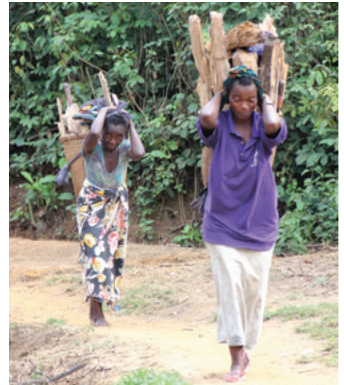
To Train women in their responsibilities as mothers, wives, and as strategic citizens