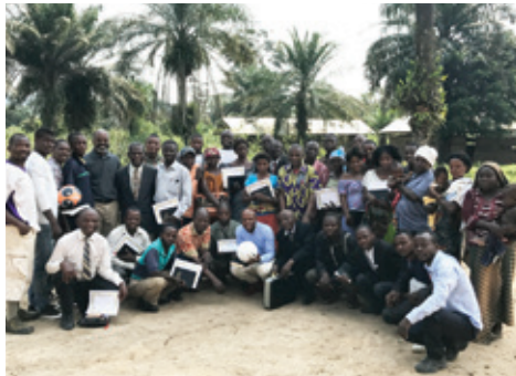
To Establish a Center For Human Flourishing from where leaders will be trained

Pray for our different ministries in DRC, the schools, the churches, and our community transformation efforts.