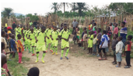
To Revive our Sports Ministry and Community Bible studies in all our churches