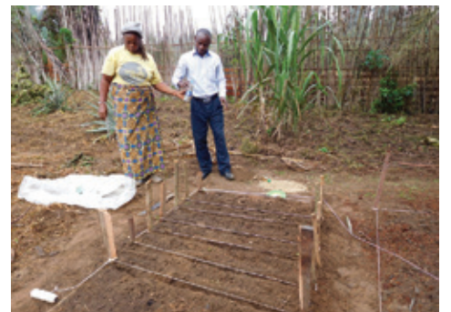
To Develop cooperatives with the graduates of our Bible Based Agricultural Training